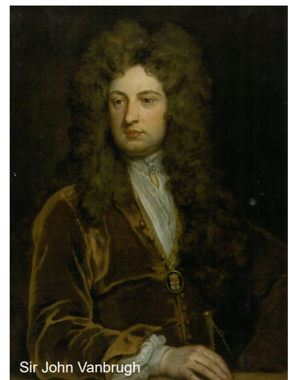
Sir John Vanbrugh

Many of the fireplaces that still exist in the mansion today were moved from Vanbrugh's original house.