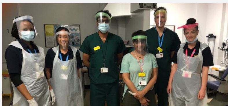
Staff at St Thomas's hospital wearing PPE from Claremont (see p4)

I think the most difficult aspect of the pandemic is the lack of social interaction for those admitted into hospital. With families no longer permitted to see patients face to face, the ward staff became proxy family for patients, and so we must be extra careful to manage their social and mental health needs in addition to managing their physical condition."