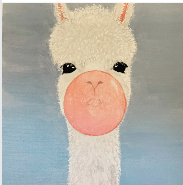
Lama in lockdown blowing gum